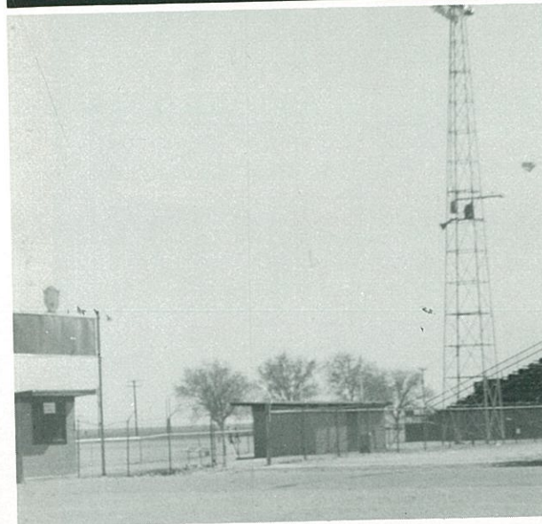
Wildcat field and stadium

This is the "Wildcats" 50th year. The school is filled with laughter and cheer. The school seems smaller as each year goes, But a lot of pride and spirit it still shows. When graduation comes it's hard to believe The students actually don't want to leave. The students have changed and so has the school. But friendliness here is one handy tool. The teachers are willing to give all they can; When you're in need they'll lend you a hand. You'll look back at pictures and friends some day And "I once was a Wildcat," is what you will say.