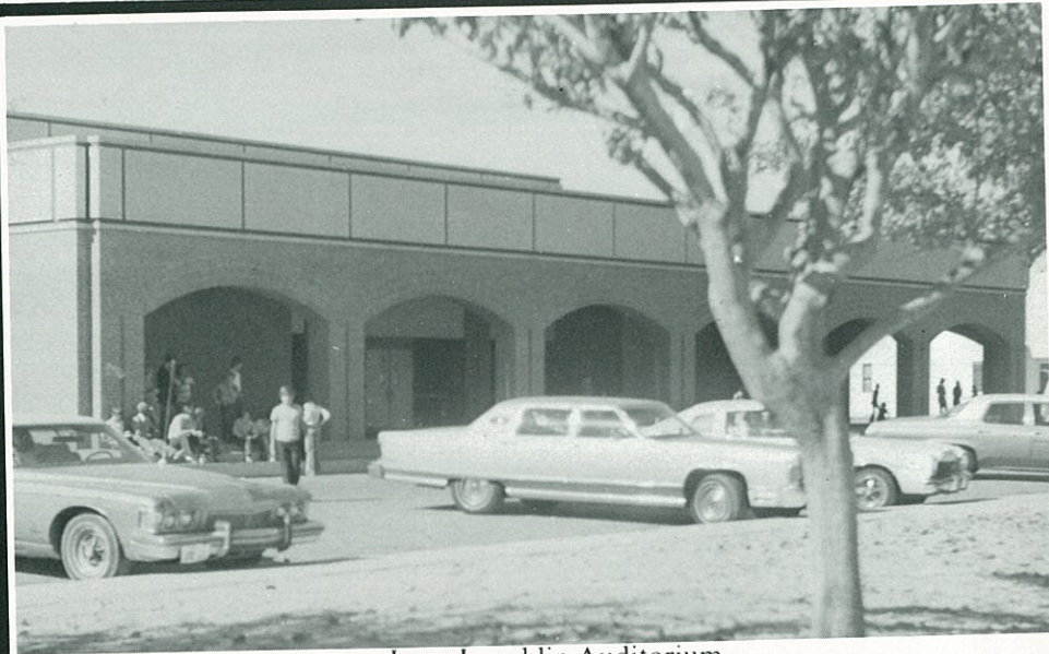
Lena Laughlin Auditorium Completed 1968