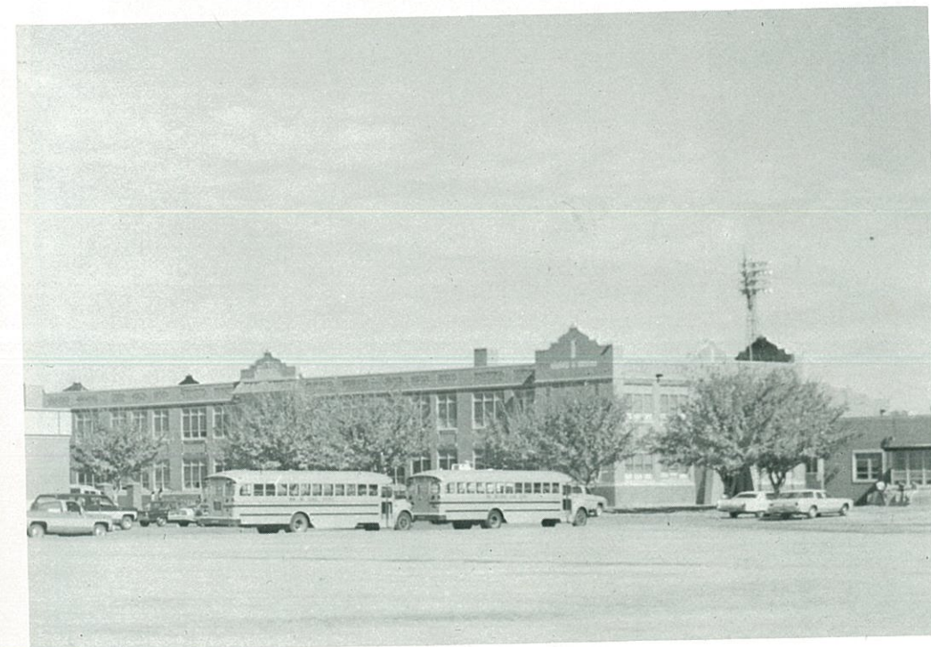
A familiar scene at noon.